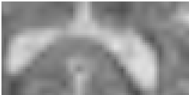
Fitted Values at Double Resolution