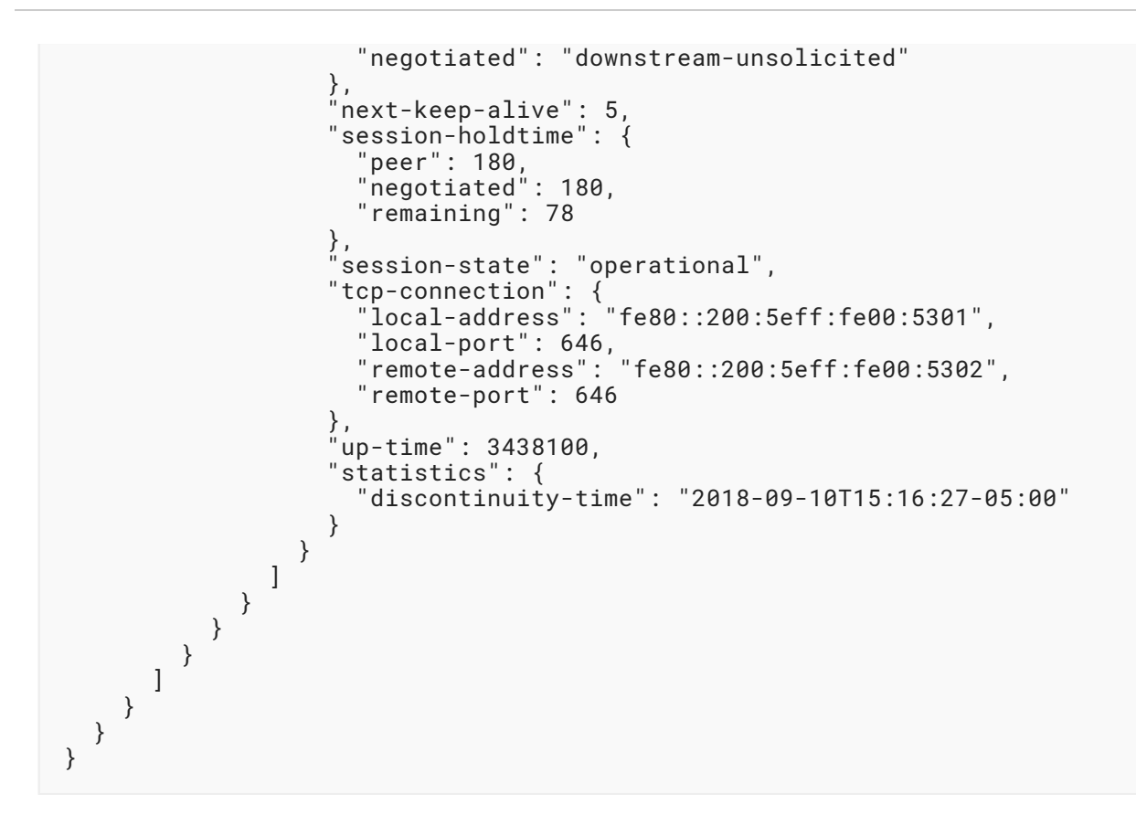
Figure 14: Example Operational Data in JSON