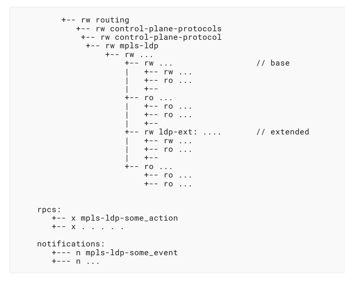
Figure 1: LDP YANG Tree Organization

The following diagram depicts high-level LDP YANG tree organization and hierarchy: