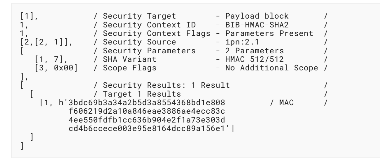
Figure 6: Example 1 - BIB Abstract Security Block (CBOR Diagnostic Notation)

The abstract security block structure of the BIB's block-type-specific data field for this application is as follows.