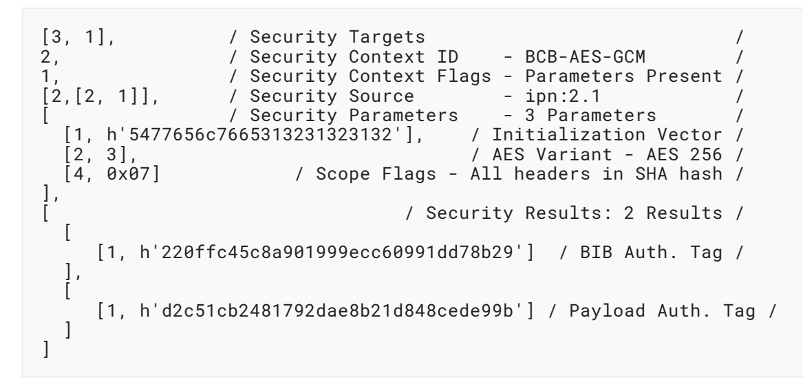
Figure 28: Example 4 - BCB Abstract Security Block (CBOR Diagnostic Notation)

The CBOR encoding of the BCB block-type-specific data field (the abstract security block) is: