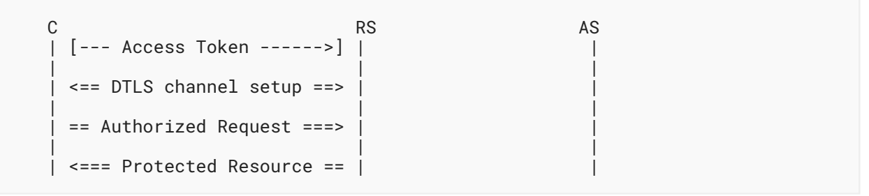
Figure 2: Protocol Overview

Figure 2 depicts the common protocol flow for the DTLS profile after the client has retrieved the access token from the authorization server (AS).