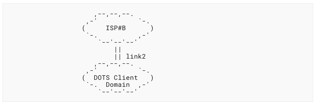
Figure 16: Multihomed DOTS Client Domain