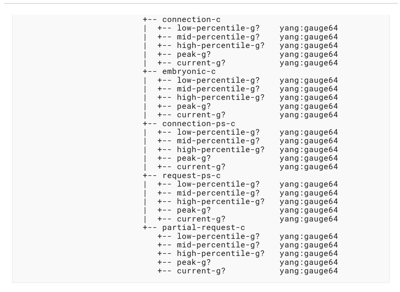
Figure 29: Attack Details Tree Structure

In order to optimize the size of telemetry data conveyed over the DOTS signal channel, DOTS agents MAY use the DOTS data channel [RFC8783] to exchange vendor-specific attack mapping details (that is, {vendor identifier, attack identifier} ==> textual representation of the attack description). As such, DOTS agents do not have to convey an attack description systematically in their telemetry messages over the DOTS signal channel. Refer to Section 8.1.6.