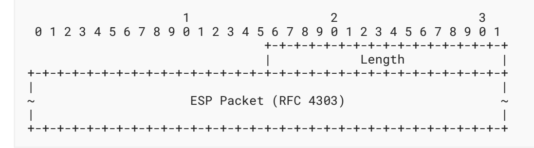
Figure 2: ESP Packet Format for TCP Encapsulation