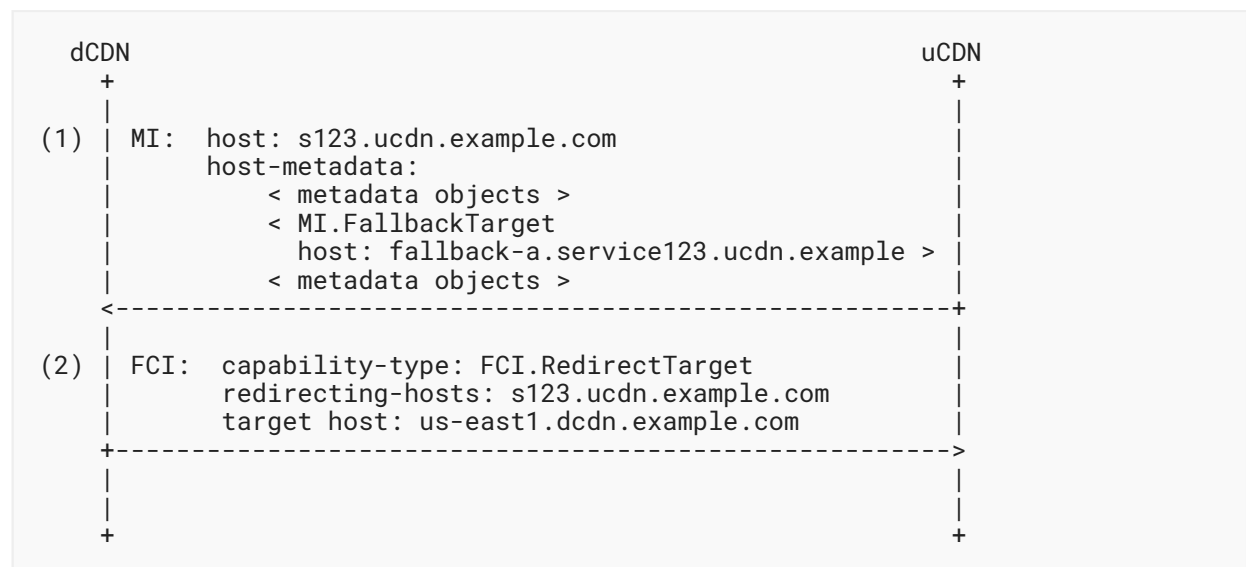
Figure 3: Advertisement of Host Metadata with Fallback Target

The uCDN advertises out-of-band the fallback target address to the dCDN, so that the dCDN may redirect a request back to the uCDN in case the dCDN cannot serve it. Using the MI, the uCDN advertises its hosts to the dCDN, along with their specific host metadata (see Section 4.1.2 of [RFC8006] ). The Fallback Target generic metadata object is encapsulated within the "host-metadata" property of each host. The following is an example of a message flow between a uCDN and a dCDN. For simplicity, we focus on the sequence of messages between the uCDN and dCDN, not on how they are passed.