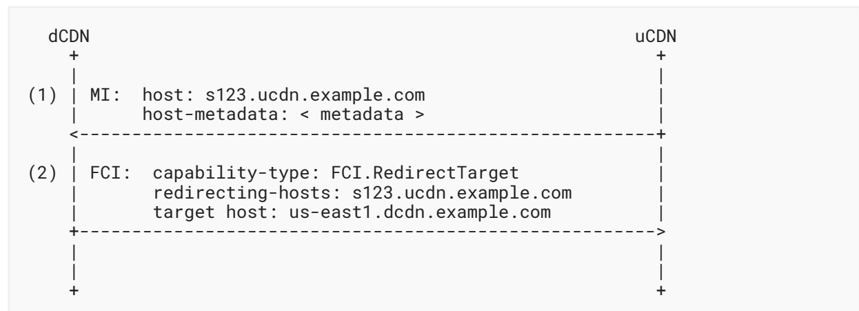
Figure 1: Redirect Target Address Advertisement

Before requests can be routed from the uCDN to the dCDN, the CDNs must exchange service configurations between them. Using the MI, the uCDN advertises out-of-band its hosts to the dCDN; each host is designated by a hostname and has its own specific metadata (see Section 4.1.2 of [RFC8006] ). Using the FCI, the dCDN advertises (also out-of-band) the redirect target address defined in Section 2.3 for the relevant uCDN hosts. The following is a generalized example of the message flow between a uCDN and a dCDN. For simplicity, we focus on the sequence of messages between the uCDN and dCDN and not on how they are passed.