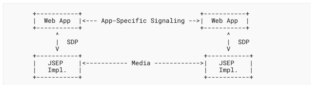
Figure 1: JSEP Signaling Model

JSEP does not specify a particular signaling model or state machine, other than the generic need to exchange session descriptions in the fashion described by [RFC3264] (offer/answer) in order for both sides of the session to know how to conduct the session. JSEP provides mechanisms to create offers and answers, as well as to apply them to a session. However, the JSEP implementation is totally decoupled from the actual mechanism by which these offers and answers are communicated to the remote side, including addressing, retransmission, forking, and glare handling. These issues are left entirely up to the application; the application has complete control over which offers and answers get handed to the implementation, and when.